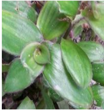
Figure 8: Tradescantia Albiflora (Telinga Kera)

Based on the interview session with the informants, Tradescantia Albiflora (Figure 8) or locally known as Telinga Kera are often used by Mah Meri people to cure kidney diseases. The leaves are to be boiled and keep the boiled water with the leaves cooled before drinking it.