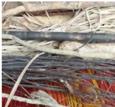
Figure 9: Eurycoma Longifolia (Tongkat Ali)