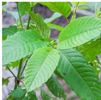
Figure 2: Mitragnya Speciosa (Daun Ketum)

The empirical findings showed that a woman (FL1) from the Semai tribe believed that Daun Ketum (Figure 2) is usually used for abdominal pain and diarrhea. The preparation method is by soaking the Daun Ketum and then filter it for drinking.