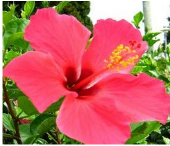
Figure 3: Hibiscus Rosa-Sinensis ( Bunga Raya )