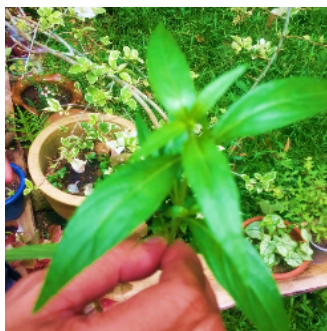
Figure 5: Andrographis Paniculata ( Hempedu Bumi )

In this study, a female informant (FM3) believed that Andrographis Paniculata (Figure 5) or Hempedu Bumi has been used by Mah Meri tribe, where the leaf decoction is taken orally for treating diabetes and hypertension.