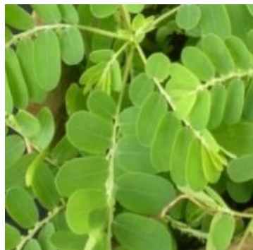
Figure 7: Phyllanthus Niruri (Dukung Anak)

Figure 7 showed the photo of Phyllanthus Niruri , which is popularly known as Dukung Anak among the Mah Meri tribe. A female informant (FM3) claimed that they used the plants mixed with boiled water to be taken orally to treat diarrhea and stomach ache. Meanwhile, the roots are boiled, and the infusion is used to treat jaundice.