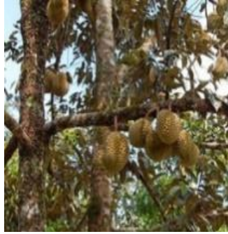
Figure 10: Durio ( Durian )