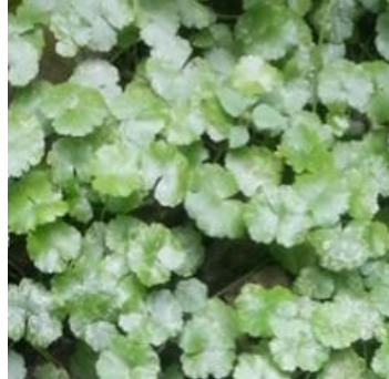
Figure 6: Centella Asiatica (Pegaga)

This study also found that Mah Meri tribe relied on the leaves of Centella Asiatica (CA), commonly known as Pegaga (Figure 6) – which can be taken orally – to treat fever, relieve pain, headache, and dizziness.