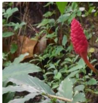
Figure 4: Zingiber Spectabile ( Tepus Tanah )